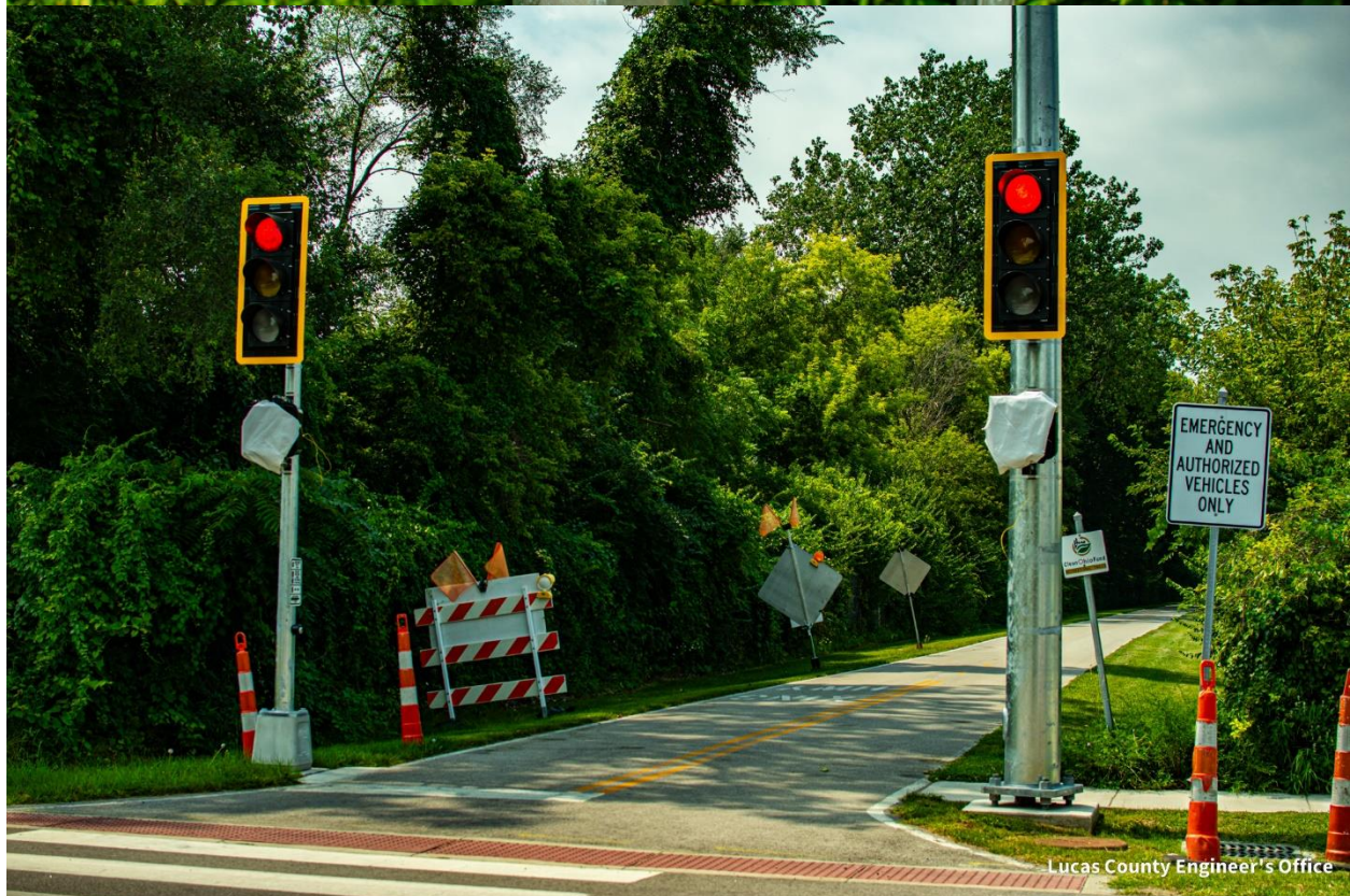
Lucas County Engineer's Office