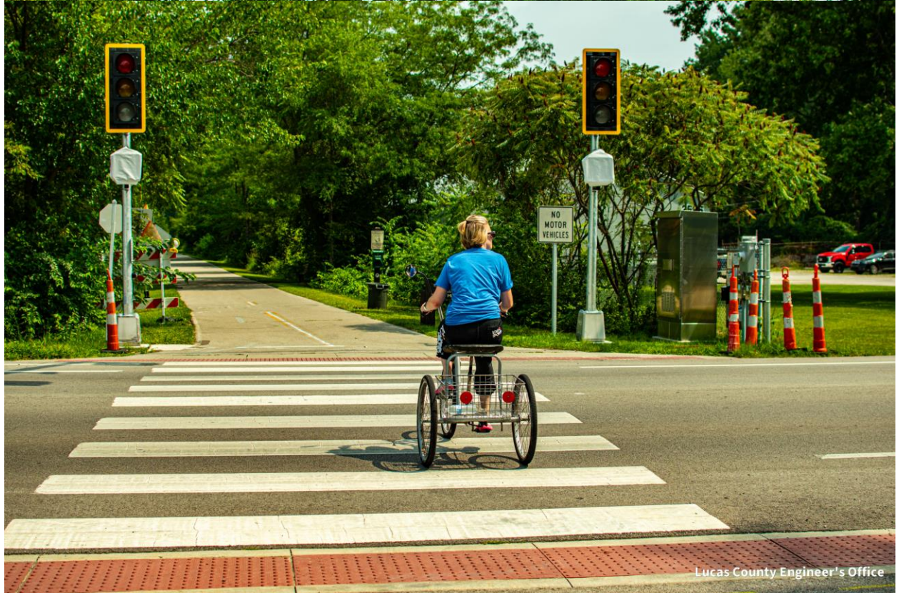
Lucas County Engineer's Office