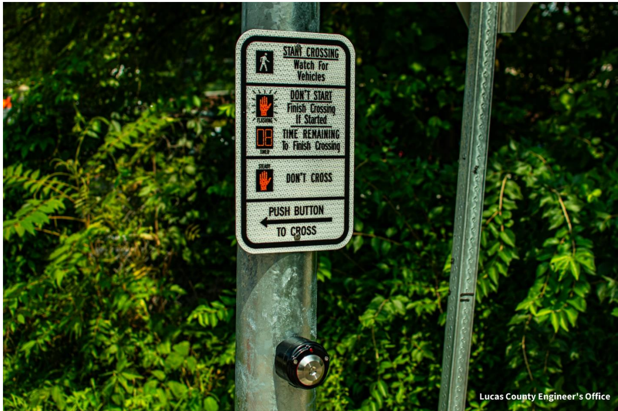
Lucas County Engineer's Office