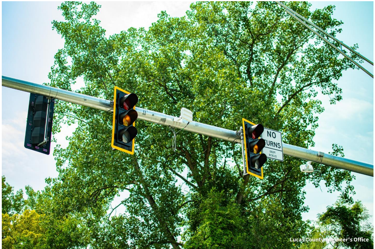
Lucas County Engineer's Office