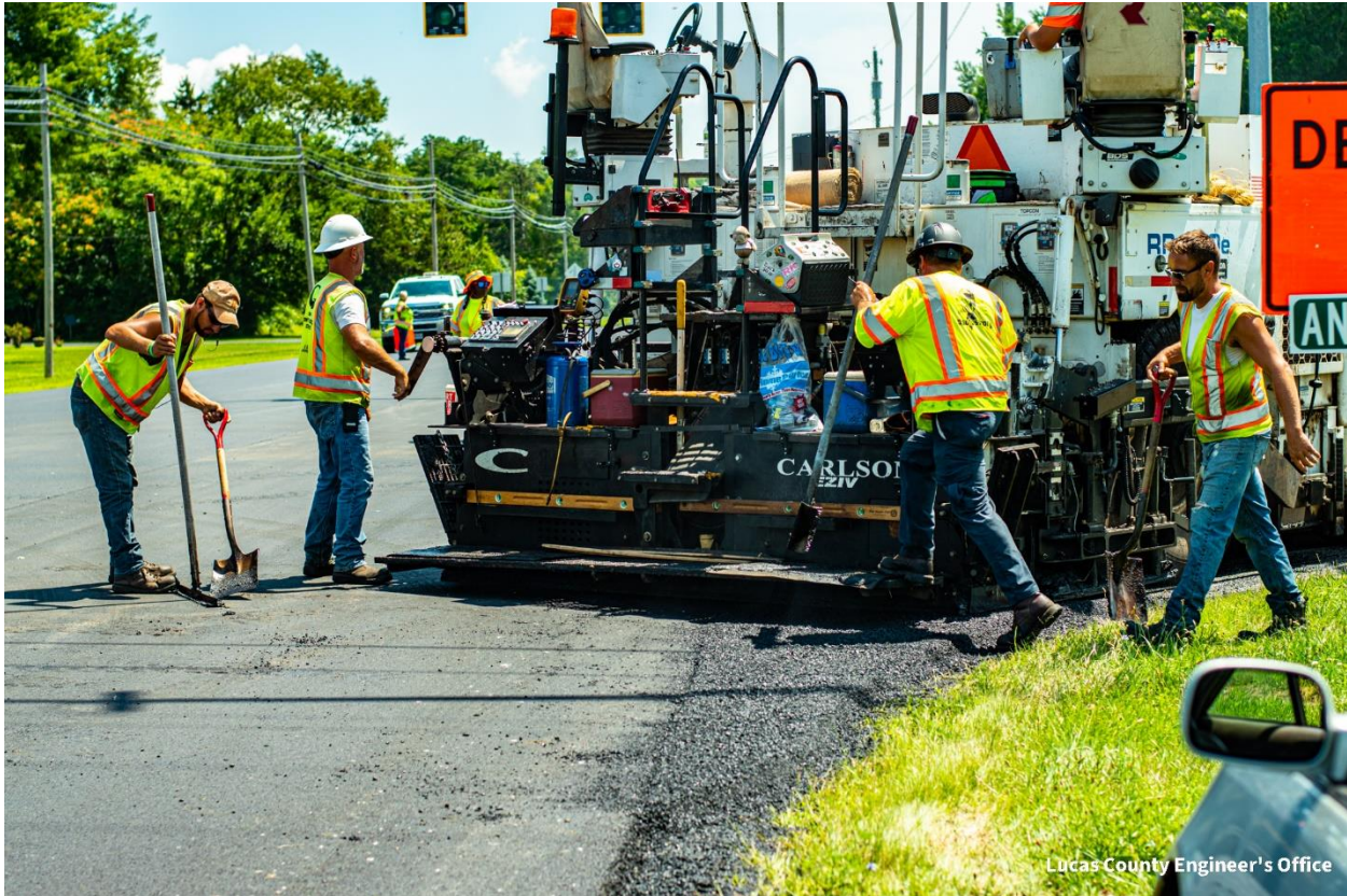
Lucas County Engineer's Office