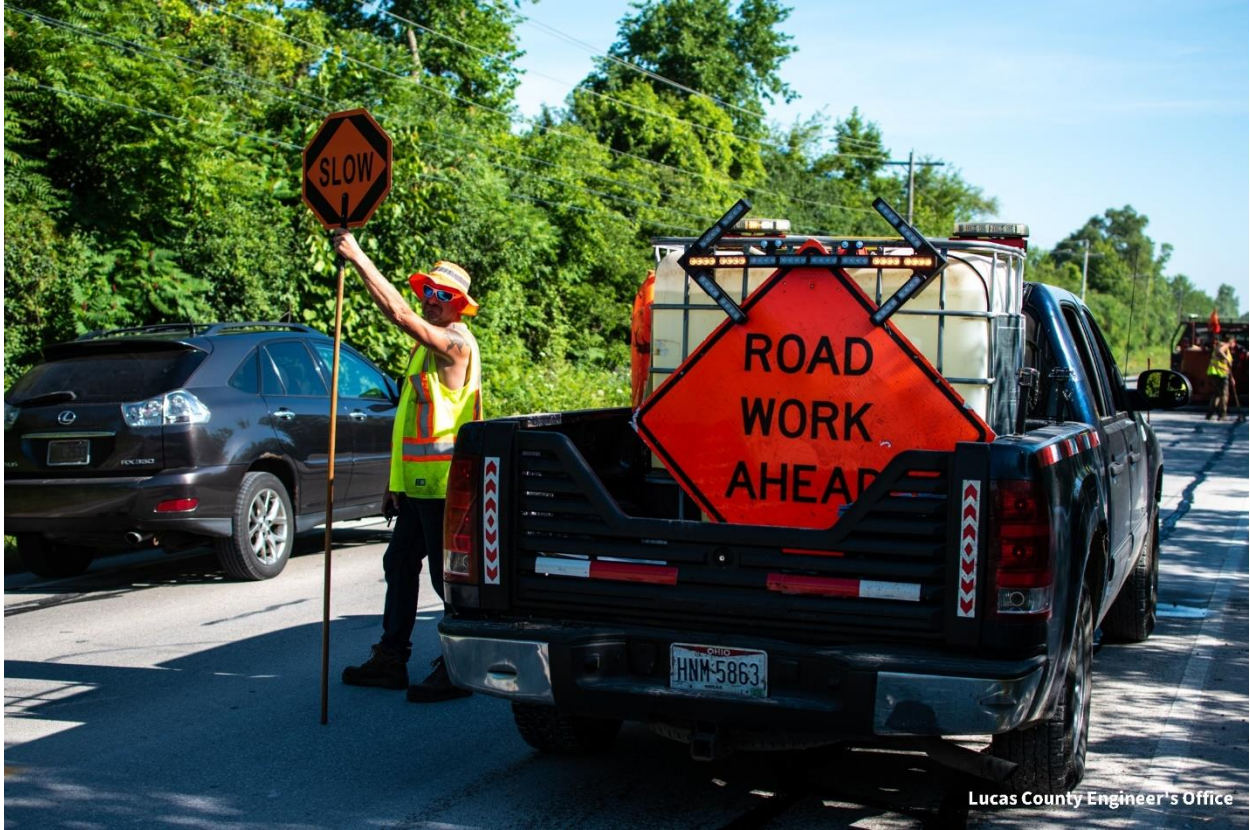
Lucas County Engineer's Office