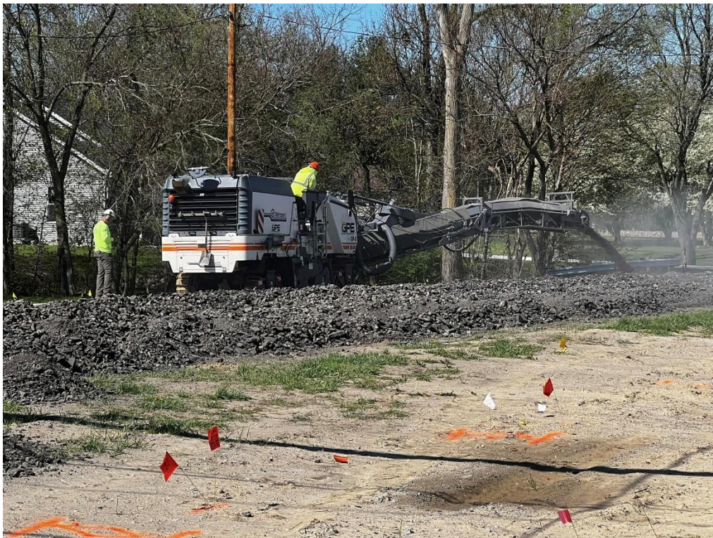
3 Road crews began milling the roadway at Garden and Albon Road Monday to begin the construction of a new roundabout improvement.