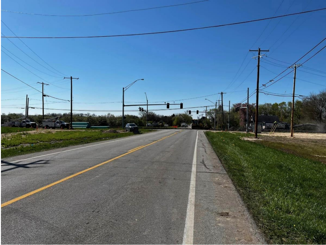
4 Looking south on Albon Road toward Garden Road, the traffic signals and poles will be removed and the utility poles relocated as part of the roundabout improvement project. The project is expected to take 45 days.