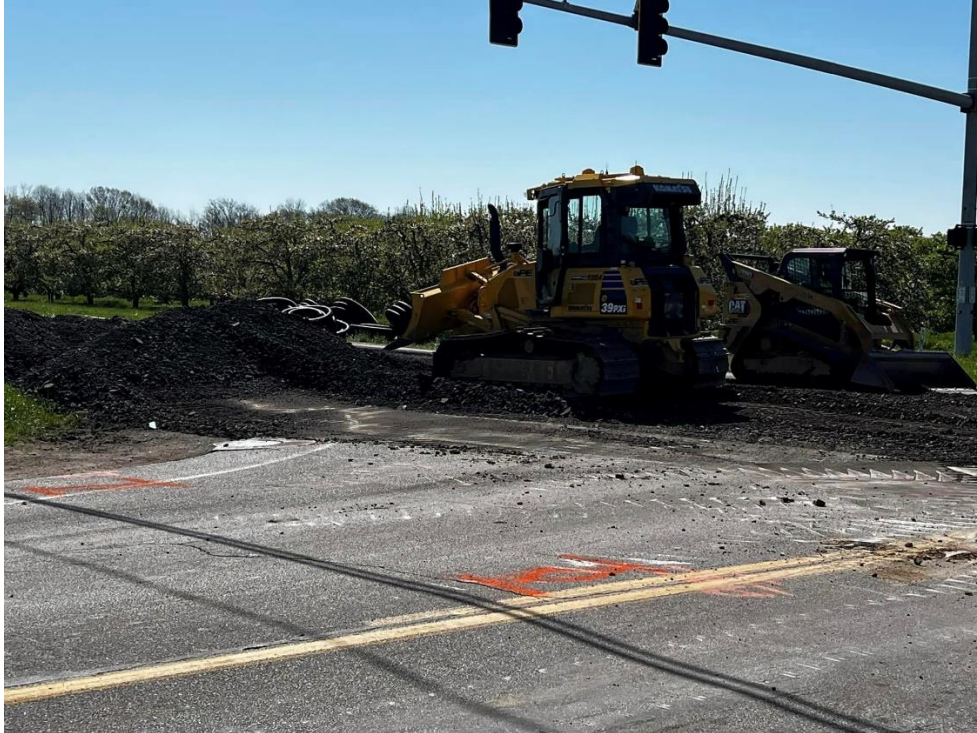
2 Road crews began milling the roadway at Garden and Albon Road Monday to begin the construction of a new roundabout improvement.